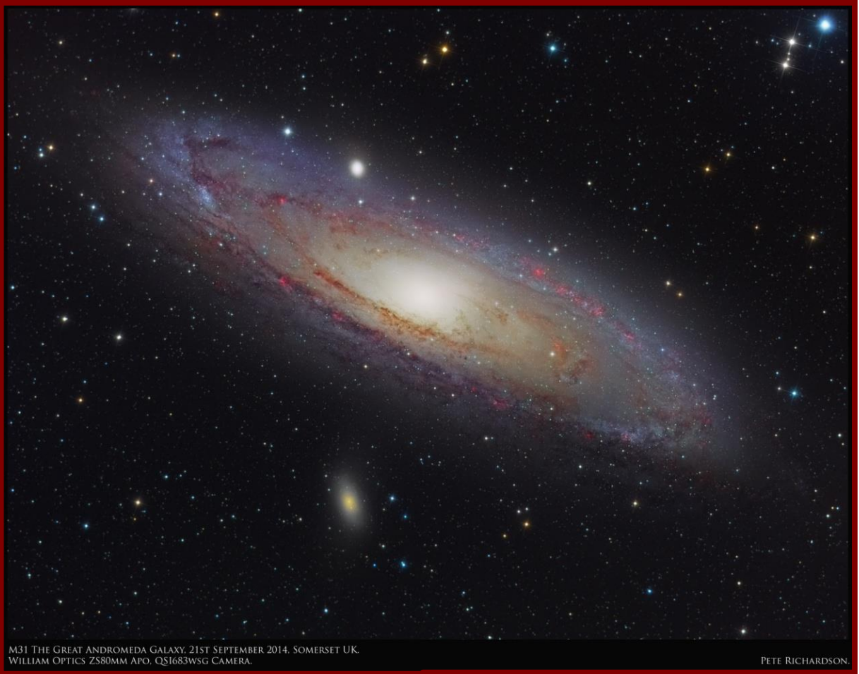
M31 THE GREAT ANDROMEDA GALAXY. 21ST SEPTEMBER 2014. SOMERSET UK. WILLIAM OPTICS ZS80MM APO. QSI683WSG CAMERA.