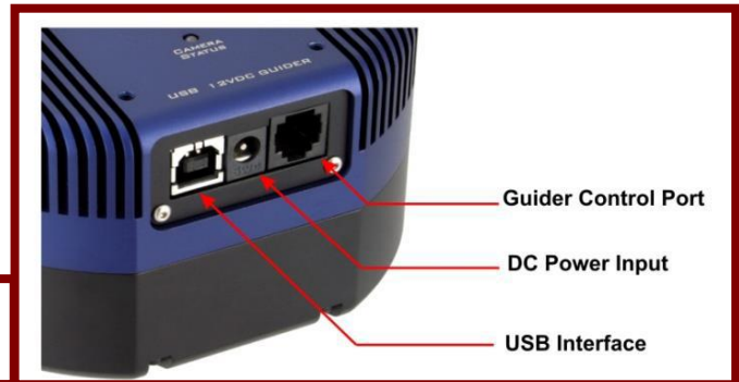
Figure 5 - Camera Outputs.

Another consideration that swayed me to the selection of this camera was its low weight. It is critical to any mount not to overload it in operation. Weight can soon build up when several other pieces of equipment are attached to the main optical tube, these typically would be a guidescope, finderscope and the counterweights themselves. The QSI683wsg comes in at 1300g which is a decent weight saving over an equivalent camera with a separate filter wheel and off-axis guider.