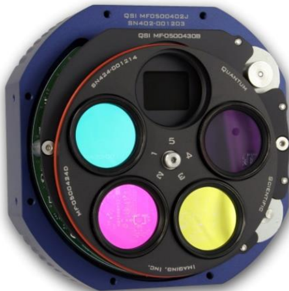
Figure 4 - Integrated filter wheel.

The sensor that comes with the QSI683 is an 8.3mp Kodak KAF-8300 and has a 3326 x 2504 pixel array, each pixel being 5.4 microns in size. This provides a very good field of view, especially when used with a focal reducer. This sensor also has a high quantum efficiency which basically is a measure of its sensitivity to faint light sources. It also has a very low noise output.