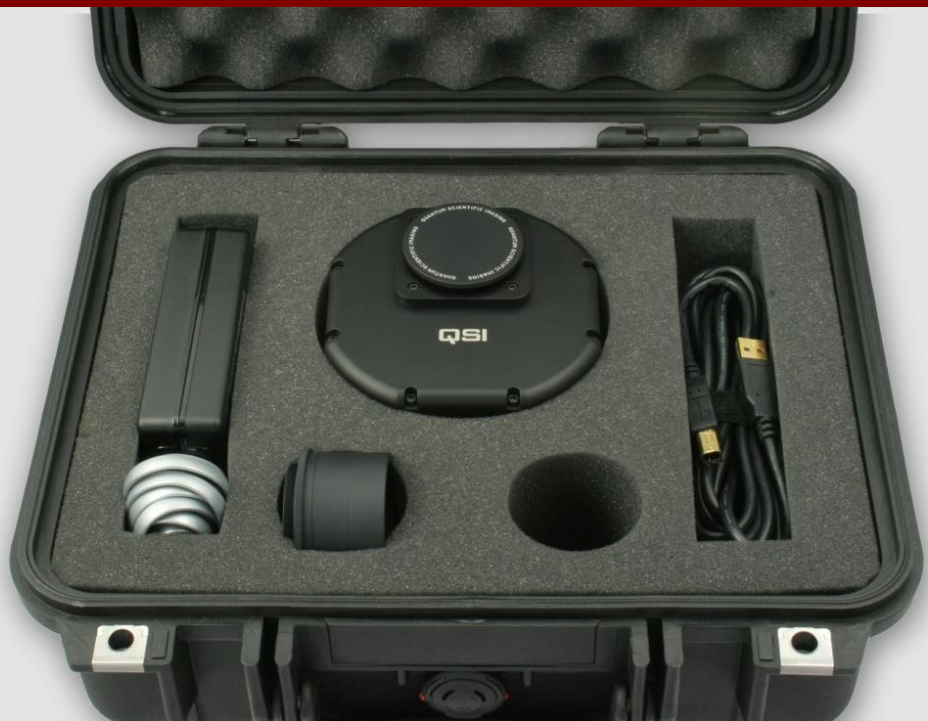
Figure 2 - Camera and Accessories.

The camera arrived after about six weeks as the UK distributor was waiting for new cameras to arrive from the US where they are manufactured. The first impression when you get your hands on one of these is just how well put together they are. Superbly engineered and built to last. It also comes with standard adaptors and a very robust Pelican case. See figures 2 & 3.